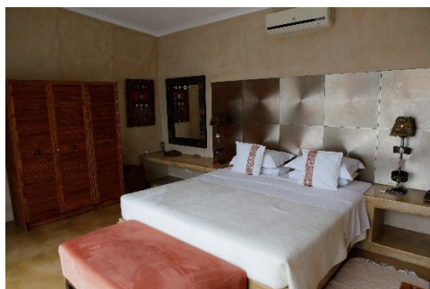
KING ROOM #1