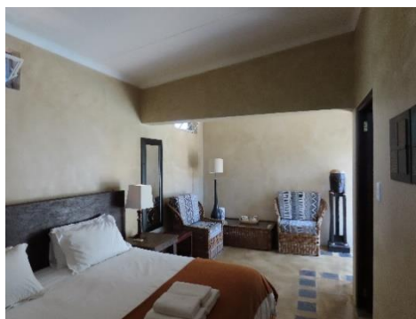
DOUBLE ROOM #6