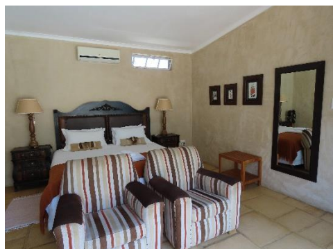
KING ROOM #4