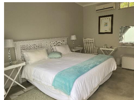
DOUBLE ROOM #3